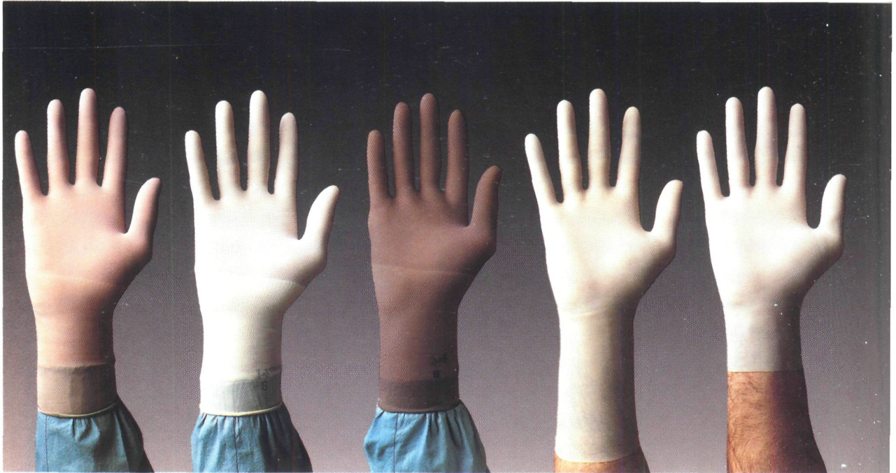
NEUTRALON® Brown Surgical Glove MICRO-TOUCH® Latex Surgical Glove MAXXUS® Orthopaedic Surgical Glove MICRO-TOUCH® XP Latex Medical Glove MICRO-TOUCH® Latex Medical Glove

P rotection. The key to our superior glove line. At Johnson & Johnson Medical, Inc., we have a reputation that spans more than 20 years — years dedicated to the research and development of quality gloves that provide maximum protection, optimum fit and excellent touch sensitivity.