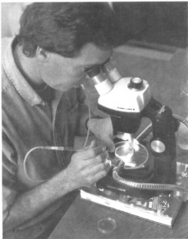
Figure 1 Photograph of the mouth pipetting apparatus in operation

ing length (ca. 60 cm) with one end fitted to the mouthpiece and the other end placed on the taper of the disposable pipette tip. A small swab of cotton was placed inside the disposable pipette tip to absorb moisture. The Pasteur pipette was prepared by heating over a flame and drawing out to an approximately 100- \mu\text{m} orifice. This was then inserted into the large opening of the plastic disposable pipette.