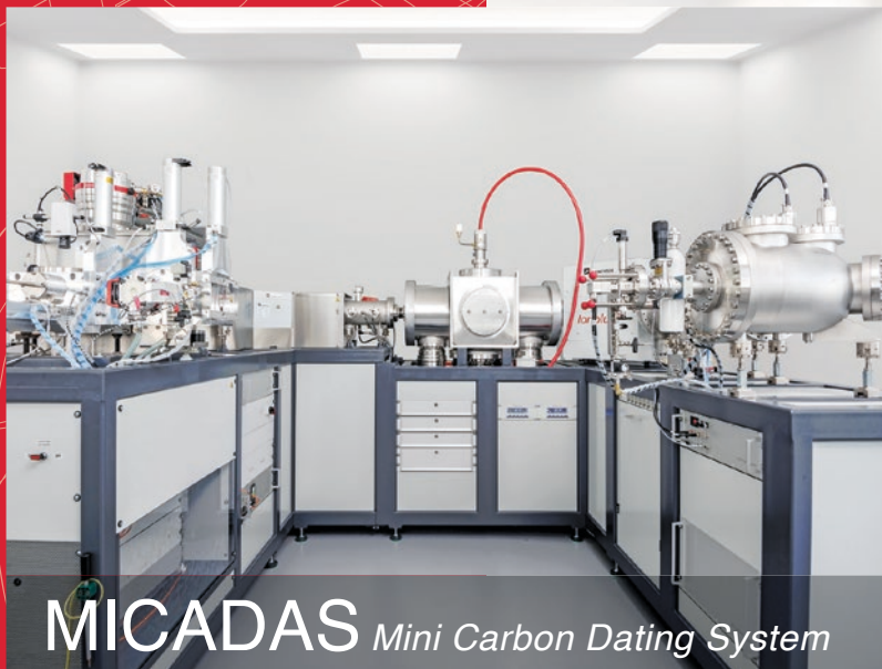
MICADAS Mini Carbon Dating System

Scientific Instruments for Radiocarbon Dating and Accelerator Mass Spectrometry