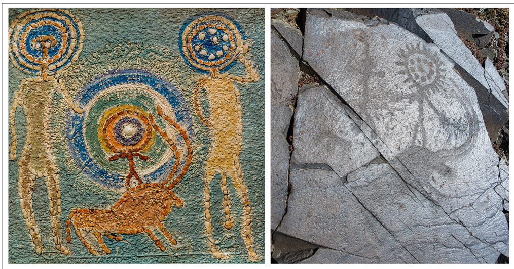
Figure 3. Left) Abdrashit Sydykhanov Planet Moon, mixed materials, 700 × 700mm, 1996 (collection of Zauresh Sydykhanova); right) the petroglyphs from the Tanbaly—the anthropomorph standing on the bull is about 400mm high.