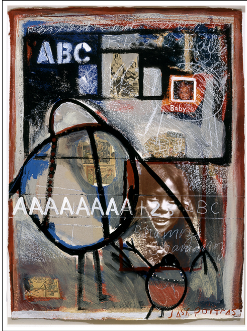
Figure 6. Jane Ash Poitras's Spanish Roots , date unknown; oil, acrylic, newspaper oil pastel, crayon and graphite on paper, 771 × 566mm.

Indigenous history scattered by numerous traumas, including residential schools. This example of trauma saw thousands of Indigenous children taken from their parents during the 1960s and 1970s and placed in foster care in 'residential schools'. In Canada, the last one closed in 1997. In addition, the technique of incorporating photographs of First Nations persons whose souls were believed to have been stolen by cameras is characteristic of Poitras's work (Figure 6). By combining the photographs with rock art motifs, the artist turns these ancient rock art images into a healing medium—that is, one that restores the Indigenous soul.