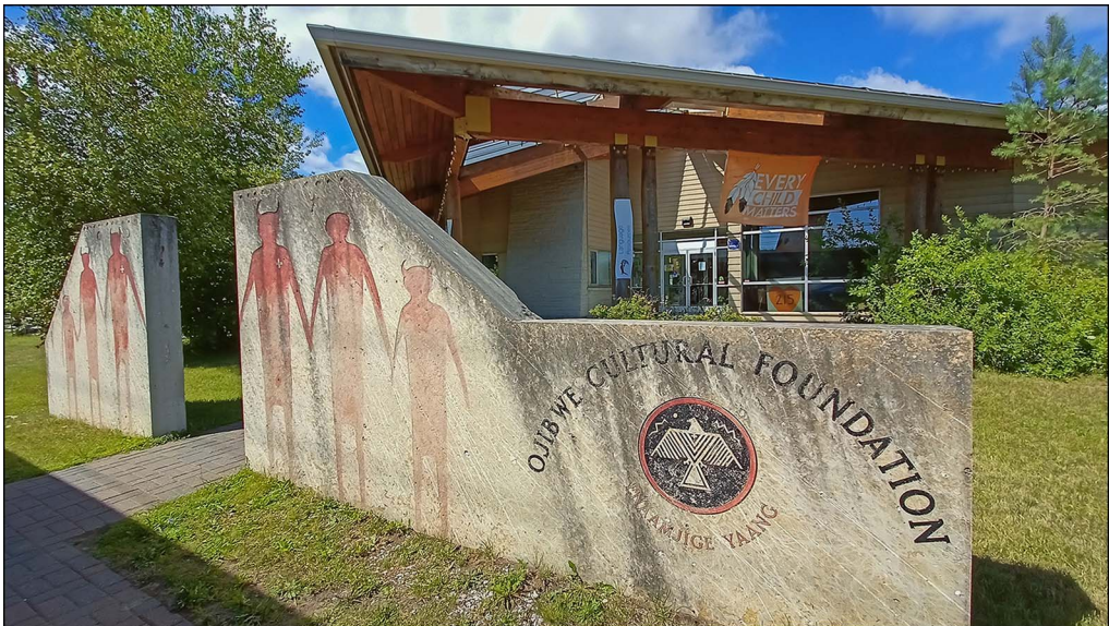
Figure 4. Entrance to the Ojibwe Cultural Foundation (M'Chigeeng, Manitoulin Island, Ontario). Six human figures designed by Carl Beam (1999) were inspired by rock art and described by Beam as “figures from our cultural past” (Hill 2010: 57).

In Canada, contemporary Indigenous art has a strong connection to rock art (Figure 4). One of the first twentieth-century artists inspired by rock paintings was Norval Morrisseau—also called Copper Thunderbird—the Ojibwa (a First Nations people of the region around Lake Superior) pioneer of modern Indigenous Canadian art. Morrisseau was the first to break the local taboo of not depicting Indigenous knowledge. His innovative style consisted of vivid