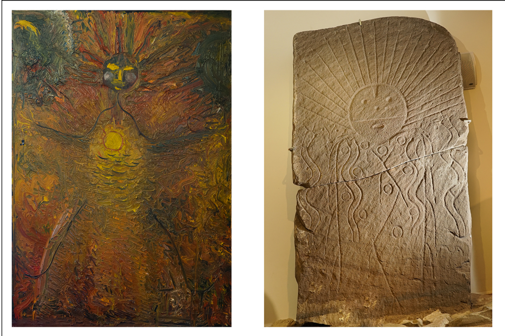
Figure 2. Left) Spirit of the Night by Alexander Domozhakov, oil on canvas, 1.6 × 1.1m, 1991 (collection of Olga Akhrimchik); right) the Bronze Age stela of the Okunevo culture (Khakas National Museum of Local Lore) (photographs by Andrzej Rozwadowski).