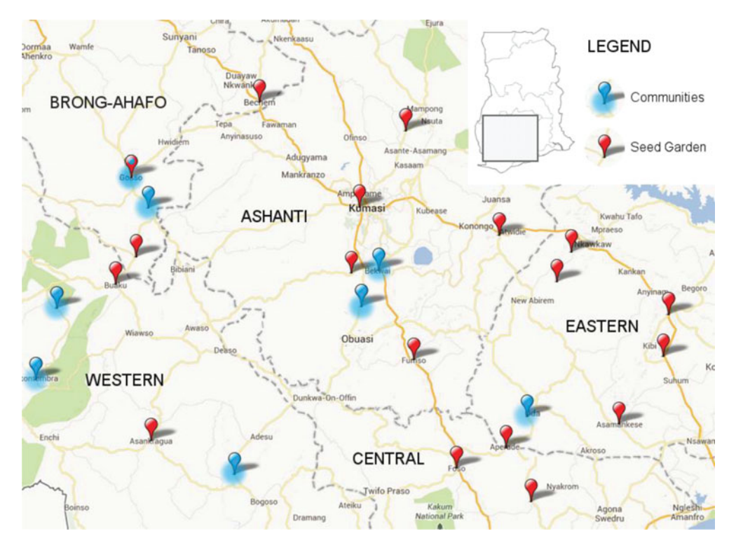
Figure 1. Map showing the cocoa growing areas of Ashanti, Brong-Ahafo, Eastern and Western regions of Ghana indicating study areas and seed gardens.

These regions fall under two broad agro-ecological zones: (i) Moist Forest that consists of the wet evergreen, moist evergreen and moist semi-deciduous forests with rainfall in excess of 1200 mm annually and; (ii) Dry Forest, which consists of the semi-deciduous inner zone and dry semi-deciduous outer fire zone with rainfall between 1000–1200 mm annum<sup>-1</sup> (Amanor, 1996). The Western region, with some forest patches remaining, represents the last frontier for expansion of cocoa cultivation and produces over half of Ghana's cocoa. This is the only region that falls under the Moist Forest. The other 'traditional' regions are said to be denuded but make up for the rest of production. The Central and Volta regions contribute marginally to cocoa productivity hence were excluded from this study. The areas were selected according to their proximity to functioning cocoa seed gardens.