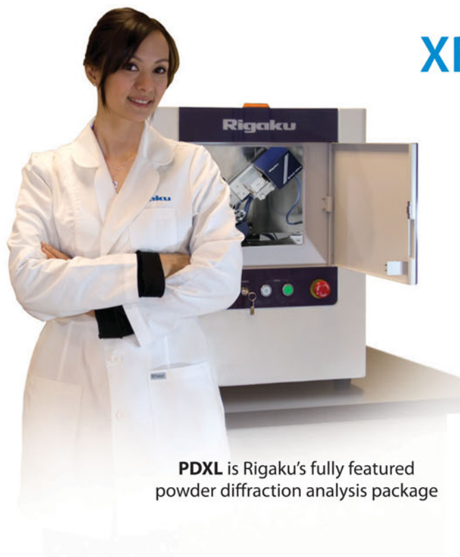
PDXL is Rigaku's fully featured powder diffraction analysis package