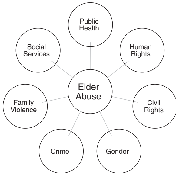
Figure 2. Co-existing conceptualizations of elder abuse.

multidimensional nature of elder abuse (Payne, 2002), there is greater interest in responding with a multidisciplinary team approach (Daly and Jogerst, 2014; Schneider et al. , 2010). Our conceptualization of elder abuse should reflect this shift.