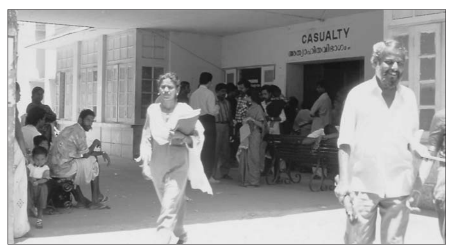
Pediatric emergency department entrance/waiting room at the SAT hospital.

role in the pediatric admissions to hospital; it accounts for 20% of all admissions and is the third-rank cause of inhospital treatment. Injury was the second leading cause of mortality, with motor vehicle accidents being the major mechanism of injury. Head injuries, by far, were the main causes of morbidity and mortality. In addition to learning research methodology, I also became convinced of the potential utility of EM in the international setting.