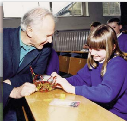
Nobel laureate Harold Kroto holds children's workshops on science.

nical issues, and so make science more accessible and understandable to the widest possible range of target audiences" ( http://www.vega.org.uk/ ). In 2007, together with colleagues at Florida State University, he founded GEOSET (Global Educational Outreach for Science, Engineering and Technology), which "uses new technology to provide outstanding Science, Engineering and Technology (SET) teaching material. It is a highly flexible medium enabling a wide range of different educational approaches to be explored and it is particularly useful for SET teachers who will find valuable downloadable teaching resource material created by the best science and technology experts and educators. A key aim is to catalyze the creation of a global network of participating sites catering to the local and global need for much improved SET education" ( http://www.geoset.info/ and also see http://geoset.fsu.edu/ ).