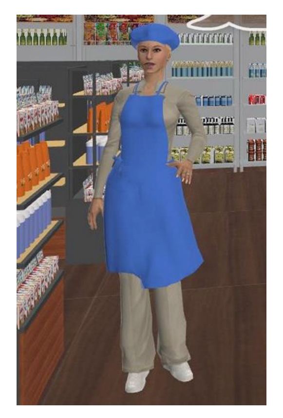
Figure 3. The avatar of a supermarket assistant.

sound of applause, would show up automatically when students completed each learning activity. There was no time limit for each session.