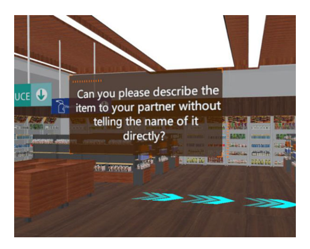
Figure 5. A sentence example for activity instruction and indication signs.

group. Students in the classroom groups (SC and TC) were permitted to try the HiVR intervention after all data collection was completed.