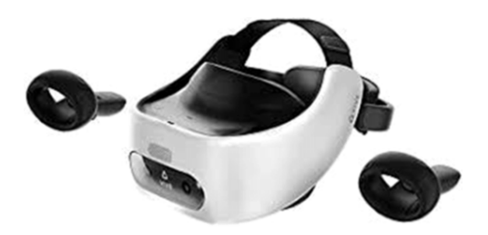
Figure 2. HTC Vive Focus Plus display and controllers.