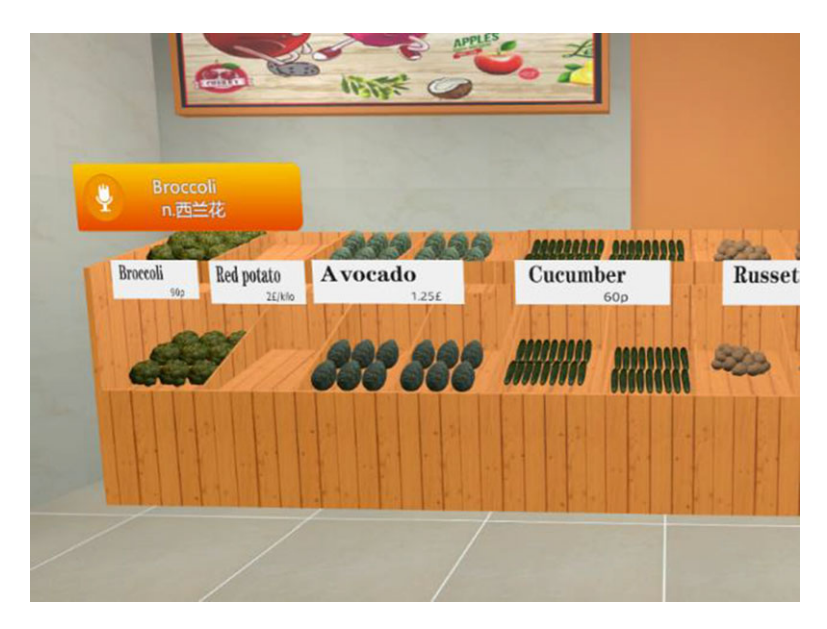
Figure 4. Vocabulary shown in orange with the sound of the pronunciation.