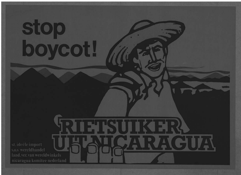
Figure 2. “Stop Boycott – Cane Sugar From Nicaragua”. During the late 1980s, a coalition of Stichting Ideële Import, SOS the National Federation of World Shops, and the committee for solidarity with Nicaragua (Nicaragua Komitee Nederland) called on consumers to buy cane sugar from Nicaragua in order to mitigate the effect of international trading embargos against the country.