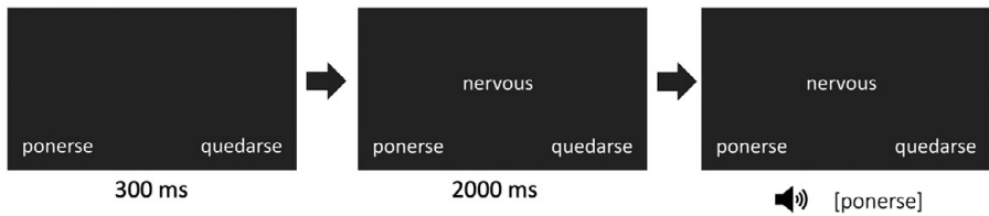
Figure 1. Sample trial for the adjective “nervous” and the target verb “ponerse.” The audio was played 2,000 ms after the adjective was displayed. The position of each of the two verbs on the screen (bottom left and right corners) was counterbalanced across participants but remained constant for a given participant.

descriptive adjectives that might be semantically related to the experimental materials, the proper adjectives “Chilean” and “Mexican” were employed for practice.