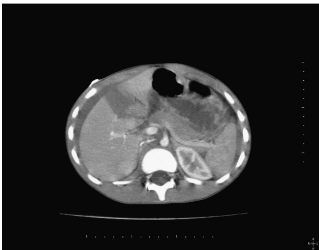
Figure 2. Common free fluid.

hypotension and tachycardia ensued. One unit of O Rh (–) erythrocyte suspension was administered. He became confused and vital signs were as follows: Blood Pressure 60/40 mm/Hg and pulse rate was 136/minute. Perioperative haemoglobin was Hb: 2.75 g/dl and Hct was 13%. On laparotomy one liter of free blood was suctioned by surgeon. Examination revealed total laceration of extrahepatic bile ducts and right lobe, as well as 60% laceration of left lobe. Portal vein sustained a 70% laceration. The portal vein was clamped first, and then repaired by cardiovascular surgeon. Then lacerated liver segments and extrahepatic bile ducts were repaired. Abdomen was closed following placement