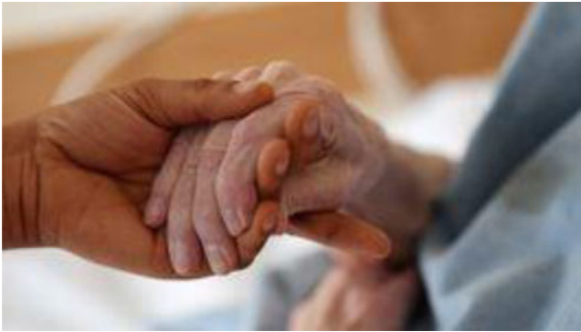
Figure 1. The most used photograph in the sample.