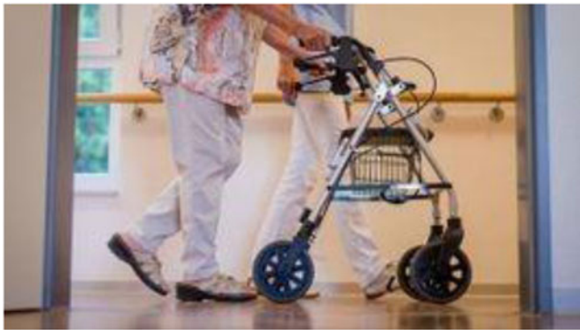
Figure 2. The second most used photograph in the sample.