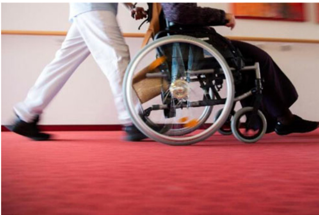
Figure 3. The third most used photograph in the sample.