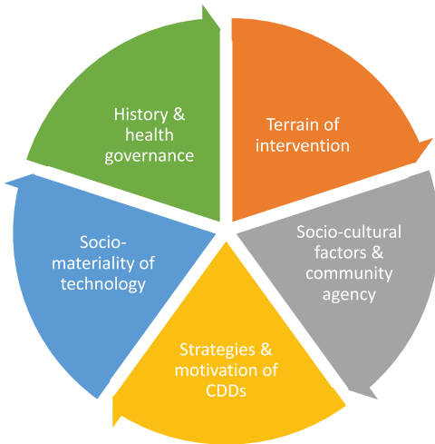
Figure 1. Five domains for assessing the effectiveness of MDA programmes for trachoma in Maasai communities.

Impressions and interpretation of the themes were discussed with the native-speaking interviewer and co-authors. Using an analytical framework adapted from Bardosh (2018), themes were classified into the framework domains (Figure 1). The domains were modified for the local Maasai context and for the type of data collected specific to trachoma. Narrative text was applied around the framework and direct quotes presented are used to show dominant views of participants.