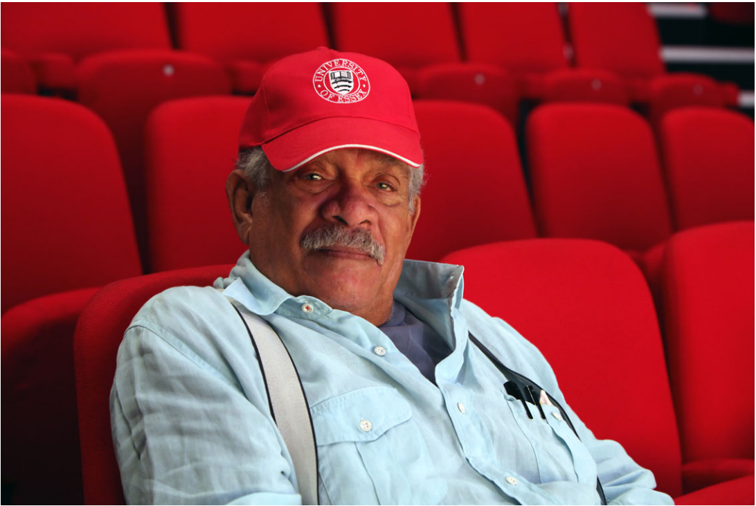
Figure 5. Derek Walcott at rehearsals of Pantomime , University of Essex, 2012.