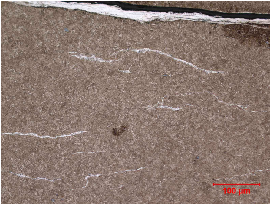
FIG. 1. Microstructural alterations (i.e., untempered martensite or stress butterflies), indicative of high Hertzian stresses, are associated with the region of subsurface origin rolling contact fatigue.