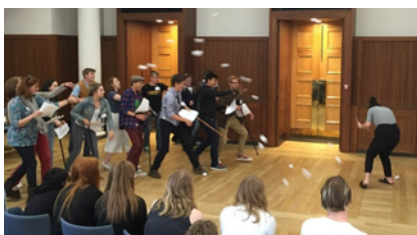
Aristophanes' Acharnians: the agon