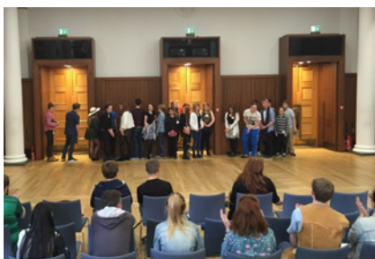
Euripides' Bacchae: chorus of Bacchantes