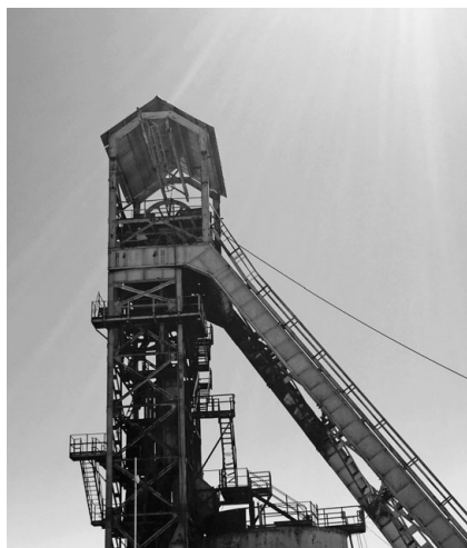
FIGURE 5.1 Tsumeb Mine, 2015.