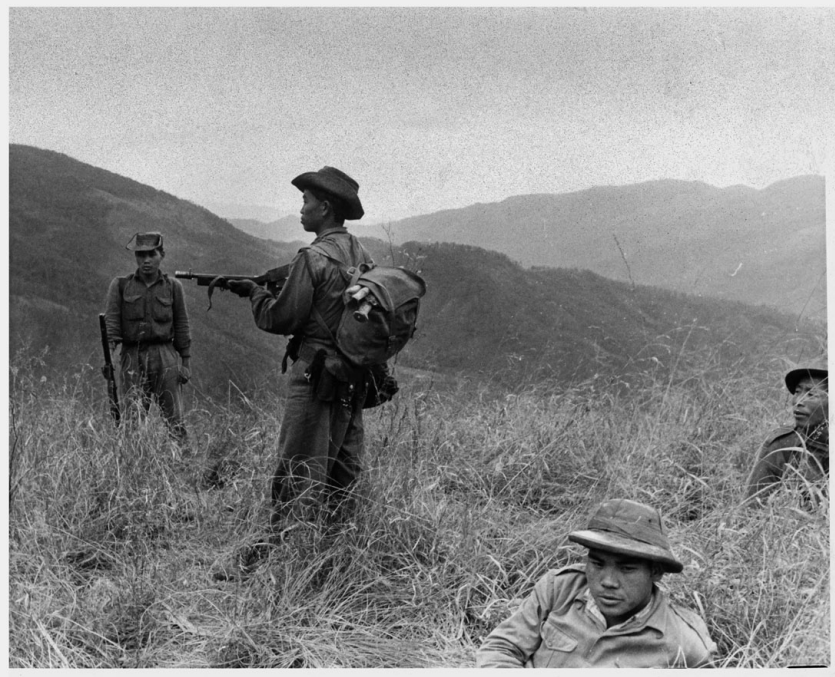
FIGURE 2.1 Naga nationalist insurgents, 1961.

government's "performance" of peaceful cultural harmony difficult to watch, and drafted a satiric poem in response: