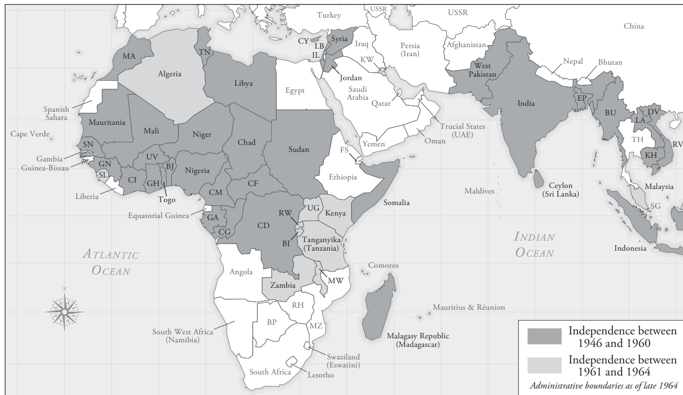
MAP 0.1 Postwar global decolonization, 1947–1964. Map by Geoffrey Wallace