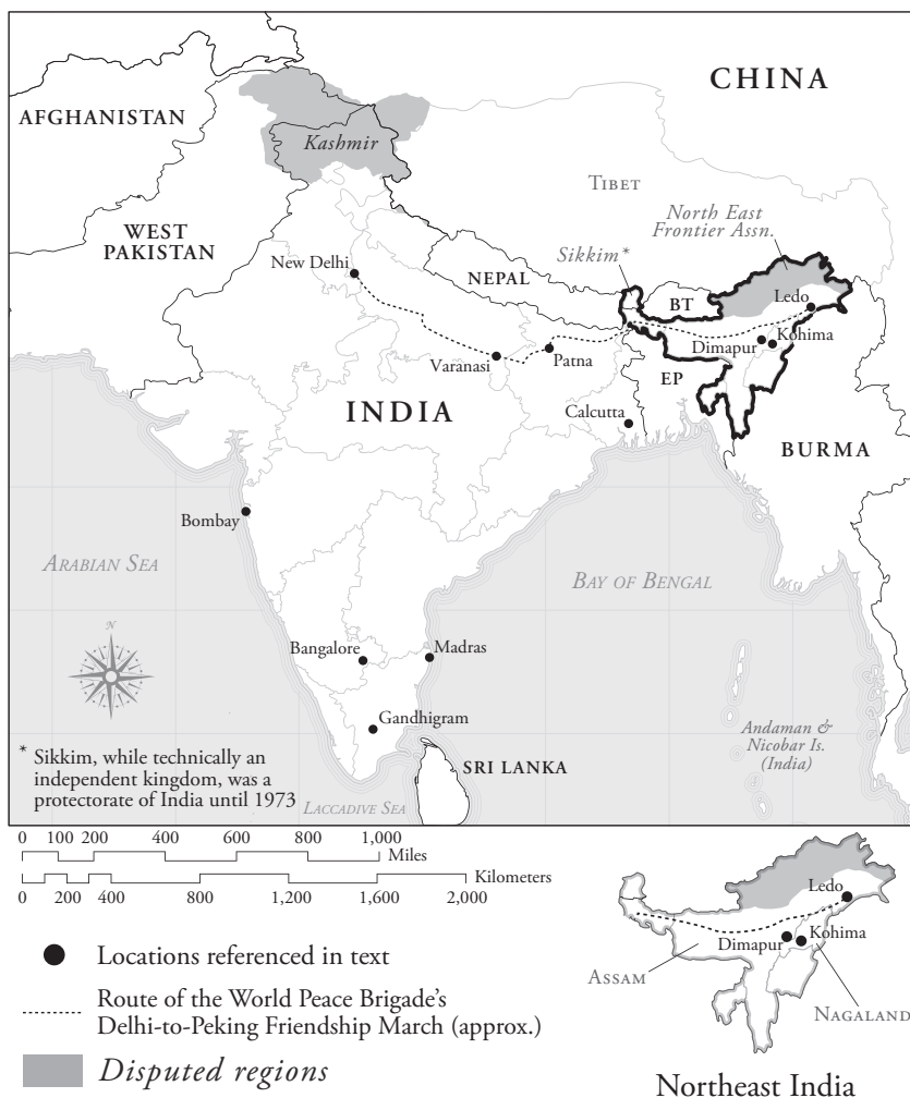
MAP 6.1 Southern Asia in the aftermath of the 1962 Sino-Indian War. Map by Geoffrey Wallace