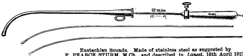
Eustachian Sounds. Made of stainless steel as suggested by F. PEARCE STURM, M.Ch., and described in Lancet , 16th April 1927.