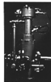
Photo Emission Electron Microscope