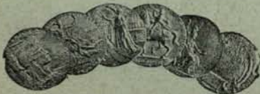
Gold Medal Allahabad 1910.

Paris 1900, Brussels 1910, Buenos Aires 1910.