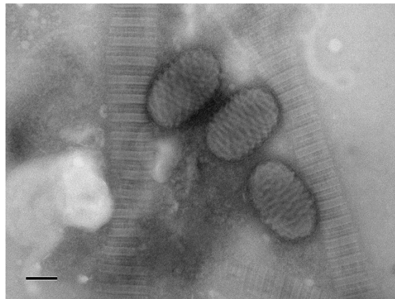
Figure 1. Electron micrograph of Parapoxvirus from caprine oral scab. Negative staining protocol was used. Bar represents 100nm.