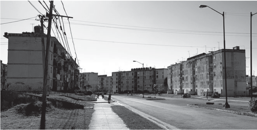
Figure 2. Workers' Housing in Ciudad Nuclear