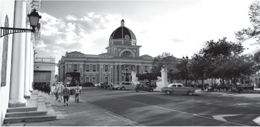
Figure 1. Parque José Martí, Cienfuegos