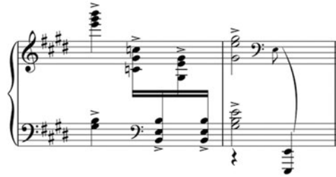
Ex. 8b Ravel, Le Tombeau de Couperin (Paris: Durand & Cie, 1918), 'Toccatà', bars 250–251