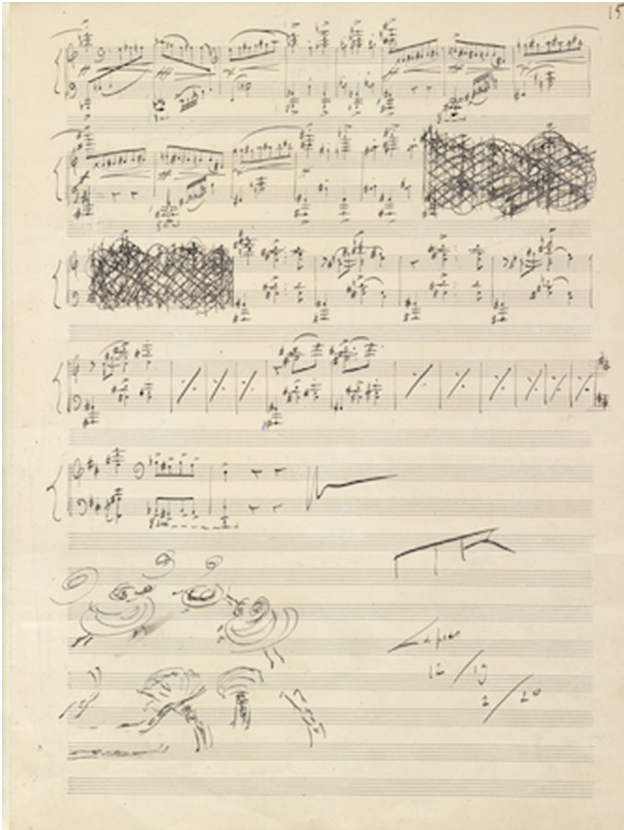
Fig. 2 Maurice Ravel, La Valse , arr. piano (two hands), autograph manuscript (1920), Pierpont Morgan Museum and Library, Cary 512

Symphonie fantastique , and in Paul Dukas's L'Apprenti sorcier , amongst other pieces. 96 Furthermore, Ravel has the orchestra react defensively to each of the bassoons' waltz fragments through accented chords in the muted horns and strings.