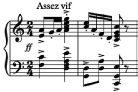
Ex. 3 The 'Grotesque Grin' in Maurice Ravel, Le Tombeau de Couperin (Paris: Durand, 1918), 'Rigaudon', bars 1–2