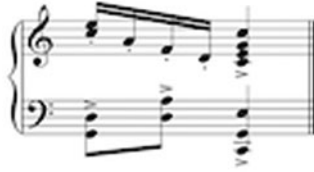
Ex. 8a Ravel, Le Tombeau de Couperin (Paris: Durand & Cie, 1918), 'Rigaudon', bar 128