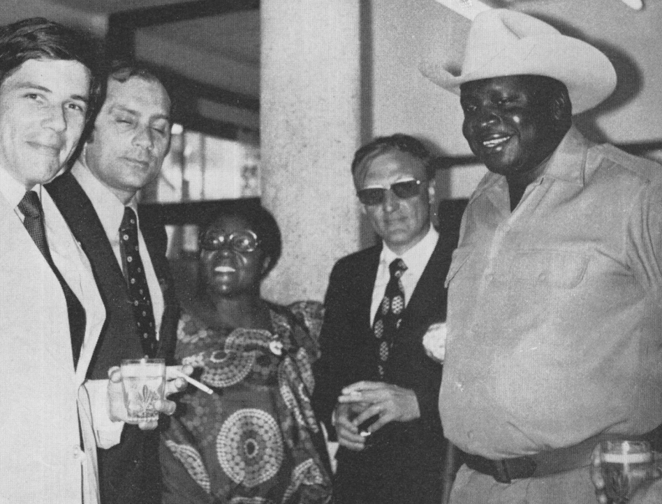
Kampala: Marshal Idi Amin Dada accompanied by delegates of the ICRC and the League. ( Centre , the General Secretary of the National Red Cross Society.)