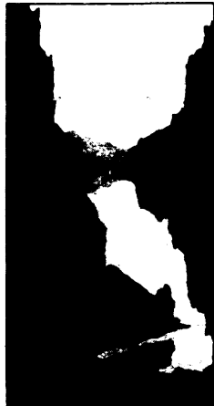
Jerome Schurr's Glew Canyon , original serigraph. Signed limited edition of 290.