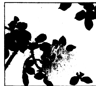
Fernando Torin's Yellow Flower , original etching. Signed limited edition of 195.