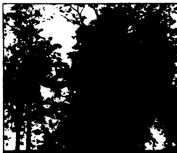
Wilbur Streech's August Sun , original serigraph. Signed limited edition of 250.