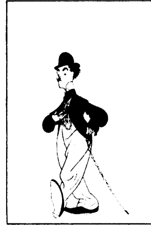
Al Hirschfeld's Charlie Chaplin I , original lithograph. Signed limited edition of 125.