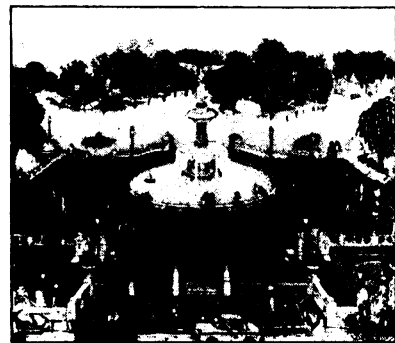
Cuca Romley's Central Park Fountain , original etching. Signed limited edition of 170.

You'll find out about the special pleasure of owning original art, instead of just visiting it.