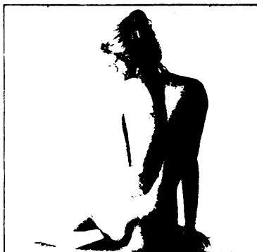
Virgine Manzano's Nude , original lithograph. Signed limited edition of 350.

In your own home, you can exhibit original work by artists who are represented in the world's great museums and galleries.