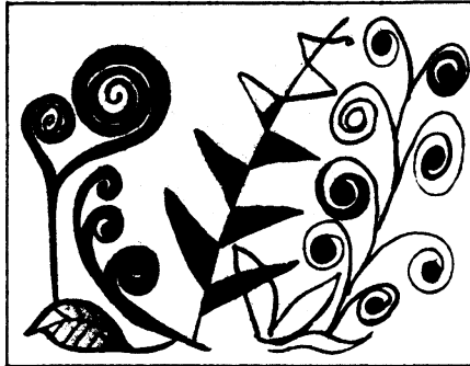
Alexander Calder's Jardin Fantastique , original lithograph. Signed limited edition of 90.