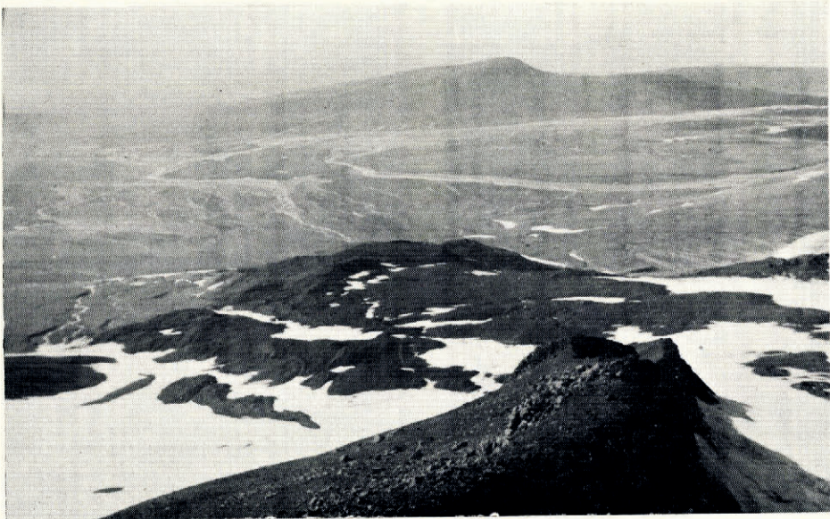
Fig. 2 (top). N.W. face of Snæfell with composite cirque divided by tuff buttness. Moraines of Glacier B. in foreground