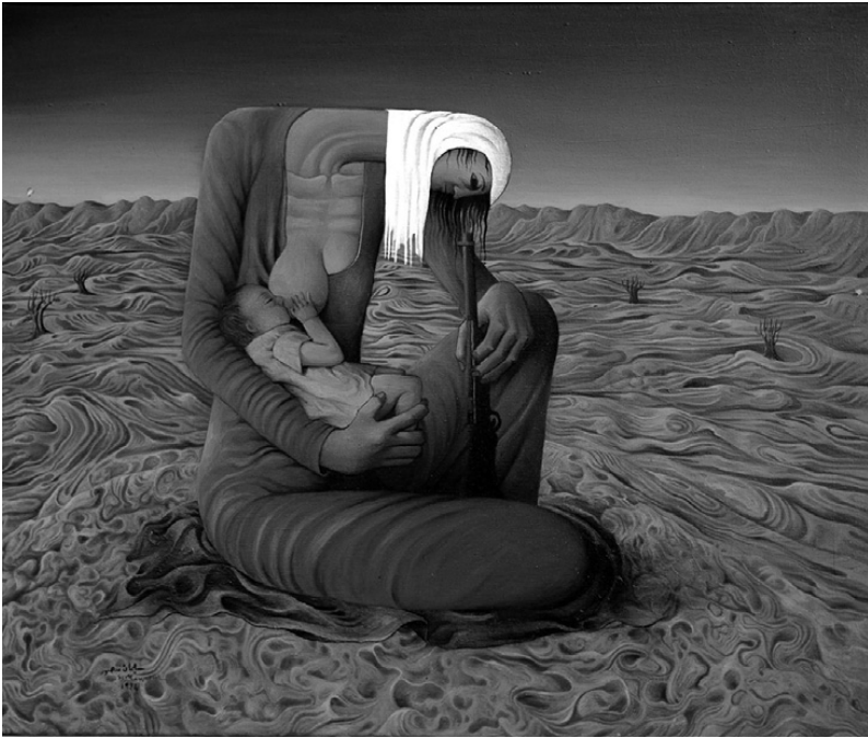
Figure 7.1 “Palestinian Motherhood” poster, Sliman Mansour, 1976. Used with the kind permission of the artist.

attributed to the late PLO leader Yasir Arafat. Research into the provenance of the first statement shared with me, “ Rahm al-mar'a al-`arabiyya huwa silahi al-aqwa ” (“The Arab woman’s womb is my strongest weapon”), invariably led me to Zionist sources. For example, the statement takes center stage in an August 2019 article by Yehuda Shalim published in the religious right Zionist newspaper Israel Today . 2 The article was translated and published in English- and Arabic-language venues, amplifying its message. I read it in Arabic translation in the London-based online newspaper Al-Quds al-`Arabi . Shalim repeats the “womb” statement putatively made by Arafat to editorialize about Palestinian Authority Prime Minister Muhammad Ashtiyia insisting that Palestinians are a majority “between the river and the sea” and thus Israel cannot continue to colonize Palestinian land. This claim,