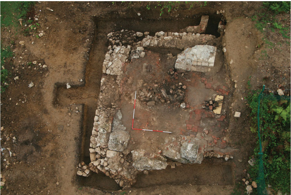
Figure 5. Overhead photograph (north at the top) showing the building exposed at the top of the hill and a burial to the west.