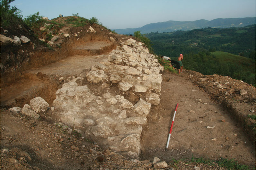
Figure 4. A section of the fortification wall along the northern edge of the top of the hill.