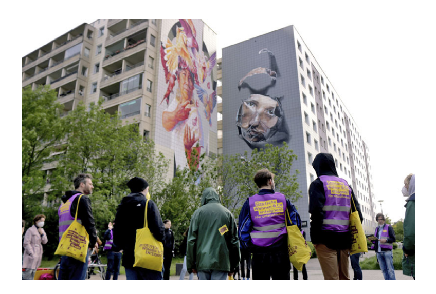
Figure 3.4 Collecting signatures in Berlin-Marzahn

Almost 350,000 signatures – more than twice as many as were needed to organise the referendum – were collected between February and June 2021, amid intermittent lockdowns, without mass events, and with lousy weather persisting until mid-May. The Kiezteams competed internally to get record numbers of signatures, while also supporting one another, sending activists from the central districts to help also in the neighbourhoods on the periphery (Figure 3.4). Then, in the run-up to the referendum, the Kiezteams campaigned door-to-door. Door-to-door campaigning is very unusual in German culture. But the ground for this had been prepared when the 'Jumpstart' group was teaching tenants how to organise themselves, back when expropriation still looked like a big, bold nothing. Or like a spectre: down-to-earth, and dressed for work.