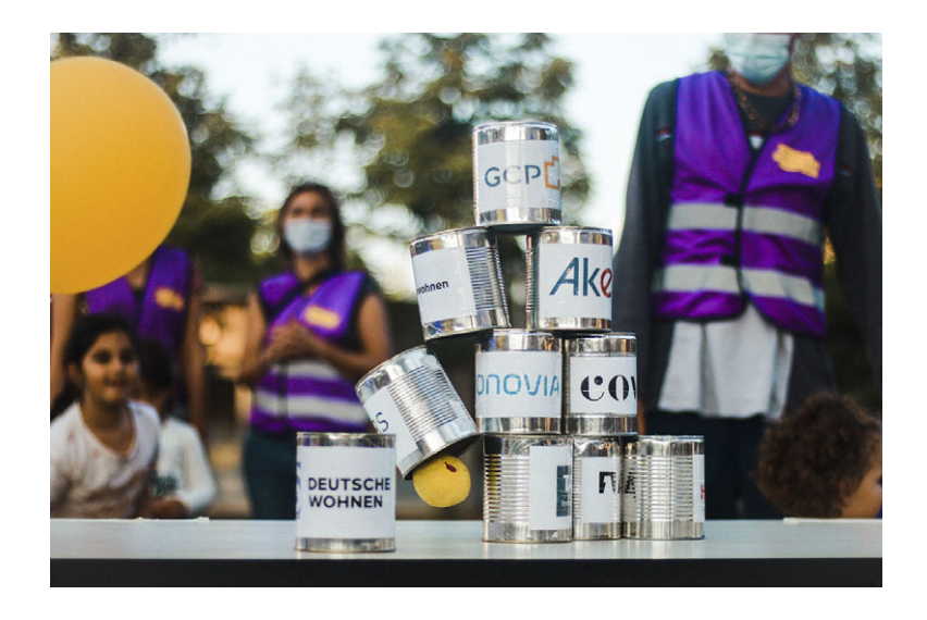
Figure 3.3 Election evening games: Will it be possible to overthrow the rule of corporate landlords?

The spectres of expropriation materialised in the daytime. These were real, human ghosts, down-to-earth and dressed for the job, in white bedsheets with cut-out holes for their eyes.