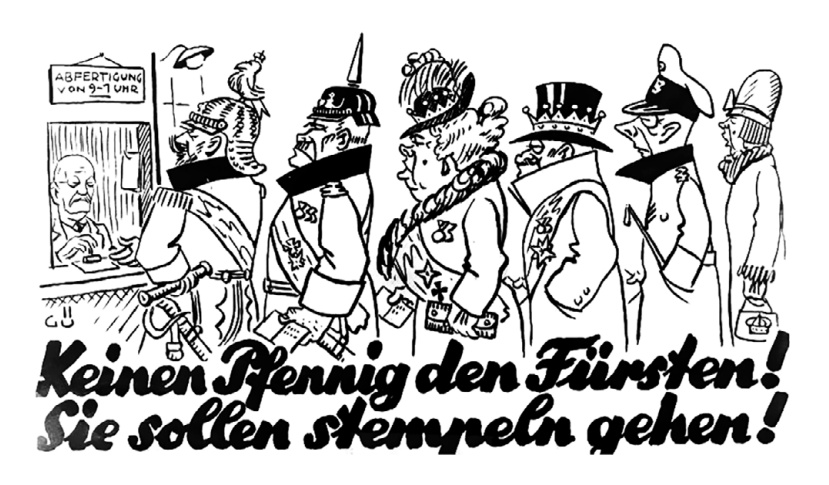
Figure 3.8 Poster for the 1926 referendum to expropriate the property of the former ruling houses (Translation: "Not a penny for the princes! Let them apply for unemployment benefits!")

The Berliner Albert Einstein voted 'Yes' in the expropriation referendum. The physicist was a vocal supporter of the 1926 referendum to expropriate the property of the former ruling houses without monetary compensation (Figure 3.8). The petition for the referendum ( Volksbegehren ) was organised jointly by