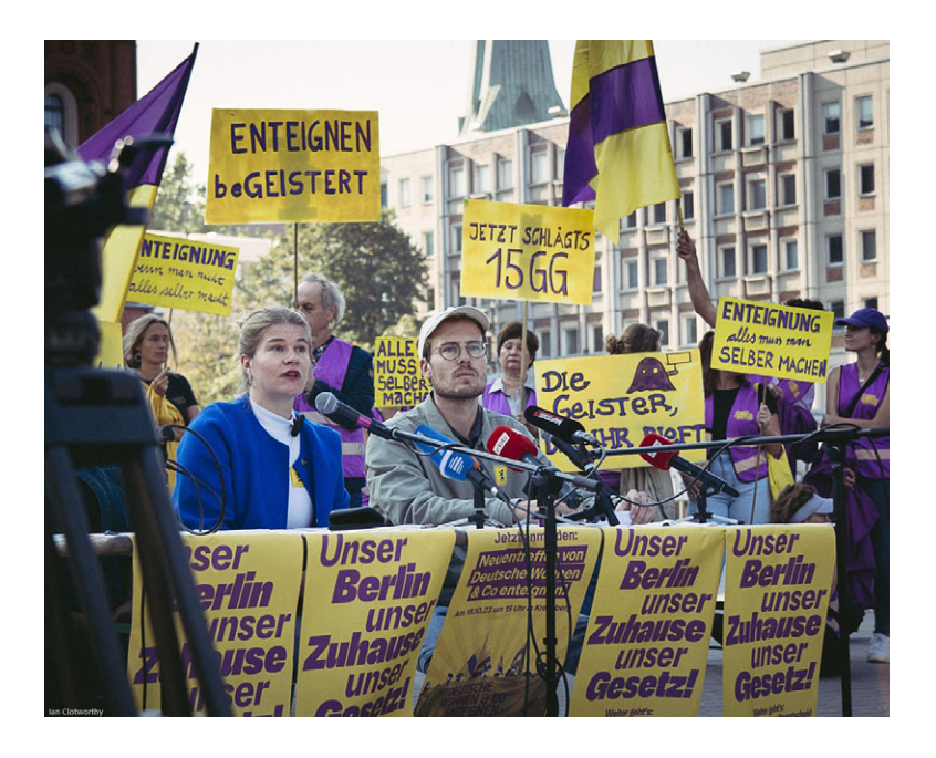
Figure 3.5 DWE announces the second referendum in front of the Rotes Rathaus (Berlin City Hall), 23 September 2023

Wegner of the Christian Democrats (CDU) – have opposed socialisation. Their resistance is hardly surprising: both their parties have been receiving campaign funding from the real estate lobby. The only way to bypass the government's inaction is to write the law ourselves and put it to a direct vote.