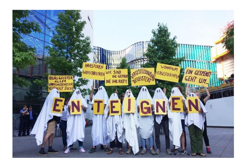
Figure 3.1 The spectres of expropriation in front of the Deutsche Wohnen Headquarters in Frankfurt, 18 June 2019