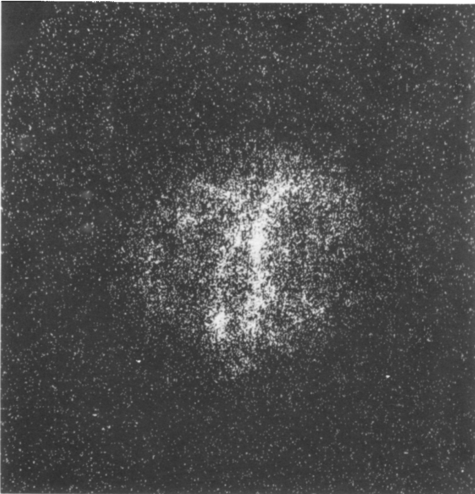
Fig. 1a X-ray image of G292.0+1.8 recorded by the High Resolution Imager on the Einstein Observatory. The number of counts per 2 arc-second square pixel ranges from 0 to 5. North is at the top and East is to the left.