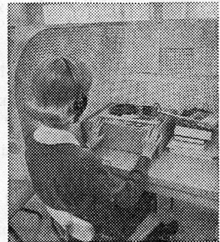
Students buy and use their own practice tapes in booths like this. Cabinetry for booths and console were made by Arlington's maintenance shop.