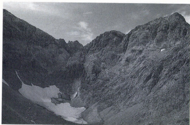
Fig. 3. General view towards the south of the relict glacier of Jou Negro (Macizo Central). The highest peak of the massif (Torre de Cerredo, 2651 m), outside the photograph, lies just to the left of the margin (taken on 20 September 1992).

comparable to that described by Serrat (1980) in Madaleta Massif (central Pyrenees), where important glacier retreat took place from the 19th century until 1957. According to Serrat, the best-developed moraines, formed in the 19th century, are separated from the present glacier margins.