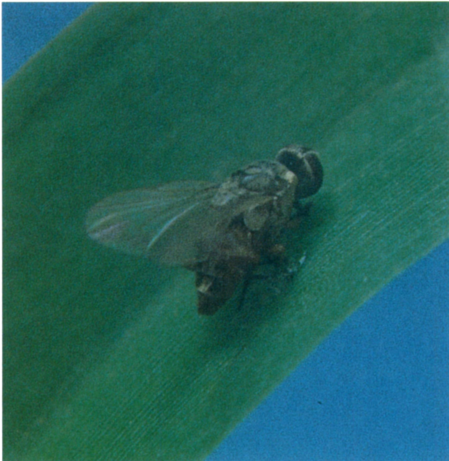
Atherigona soccata Rondani, the sorghum shoot-fly, from India