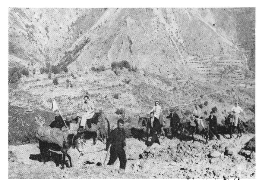
Red Cross boats for ferrying of supplies to Greek islands during Second World War.