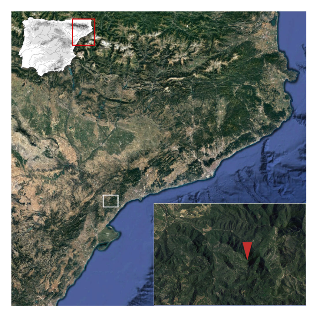
Figure 1 Geographical location: Cova de Marcó (Tivissa, Tarragona, Catalonia, Spain).