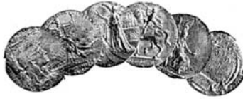
Gold Medal, Allahabad, 1910.

Paris, 1900. Brussels, 1910. Buenos Aires, 1910.