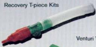
Recovery T-piece Kits