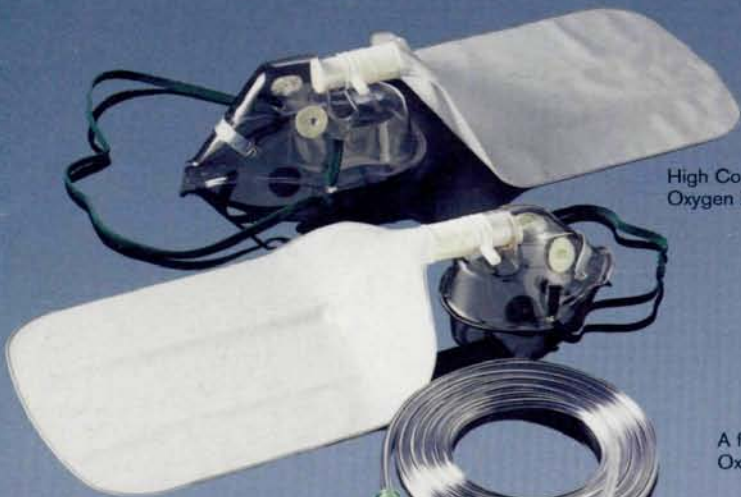
High Concentration Oxygen Masks