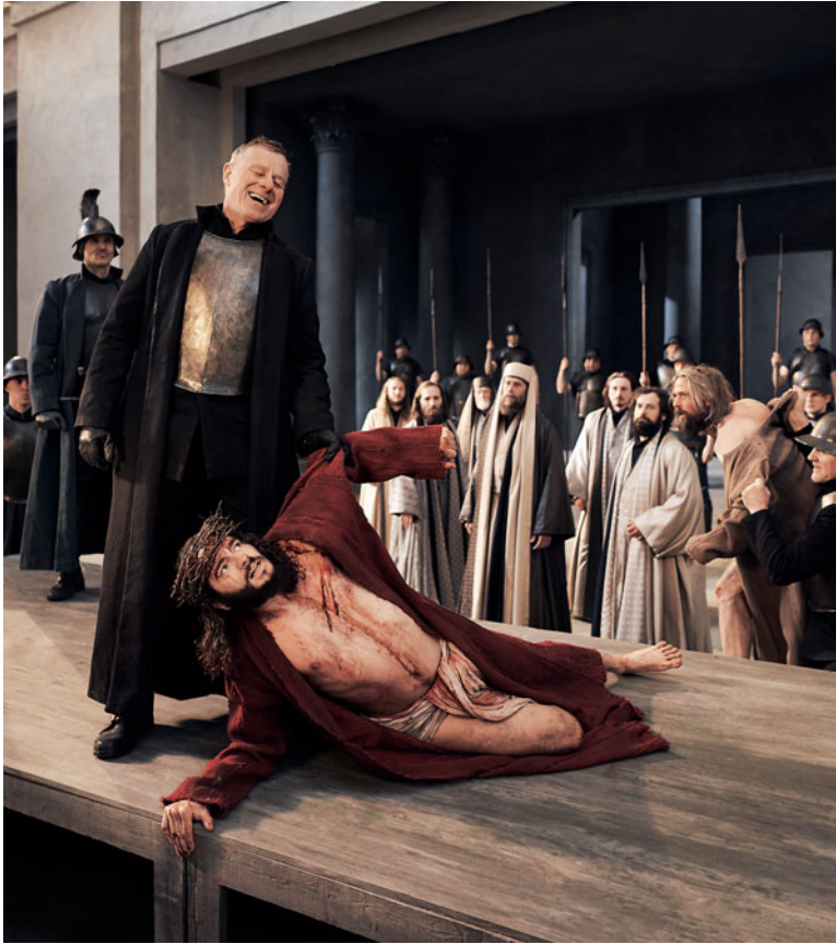
FIG. 3 Pontius Pilate presides over the torture, and eventual crucifixion, of Jesus. As detailed in this article, Pilate's character has evolved over decades to become increasingly menacing.

the stage with regal poise, costumed in gold and lavender, hair tucked neatly into headdresses. 45 In 2022, King Herod was portrayed as an irreverent jokester of a man, and his retinue – played as a bawdy and boisterous crew – were costumed in brown, with long, coarse unkempt hair, and visibly dirty skin. 46