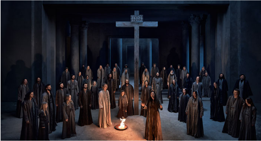
FIG. 5 The 2022 Oberammergau Passion Play stages the Resurrection without a resurrected Jesus physically present. Mary Magdalene, pictured downstage centre, looks out over the audience and declares that Jesus has returned. Near her stands an angel, who has brought on a giant flame, and around them stand the choir. The choir, here representing a subset of the larger community, ultimately take out candles and light them from the giant flame, before exiting.

friend, as a gesture of forgiveness and acceptance. He tried it out in rehearsal, spontaneously, and then kept it, with the approval of the director. 52 Another performer told me that the actors, in small groups, were constantly initiating smaller, subtler adjustments, on their own initiative, as they discussed problems and attempted to solve them. So, for example, at one of the final rehearsals, the group of actors playing apostles got together with the group of Temple Guard soldiers to discuss and rework the sequence of events at Jesus' arrest. 53 He said that he does not think they initiated changes on their own quite so much in past iterations, but that now, there is such an embrace of experimentation as a way of working that they do so organically.