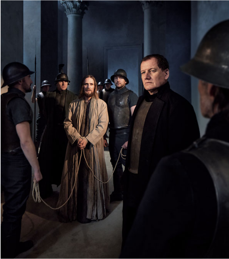
FIG. 2 The captured Jesus, held by Roman soldiers, stands before the powerful Pontius Pilate.

Other changes may be very significant to locals, though may not appear tremendously consequential to outsiders. The play's action has always been punctuated by choral music, and the choir has always (or at least since 1811) been accompanied by a narrator, called the Prologue, who explains the theological significance of the action in prose. But the Prologue, for the first time, was cut entirely in 2022: the 2022 audience is left to interpret the action for themselves. 43 And the choir, which had previously been costumed all in white, giving an angelic aesthetic, are now costumed in 2022 like seventeenth-century Bavarian villagers: they represent the original Oberammergauers who started this tradition (Fig. 4). 44