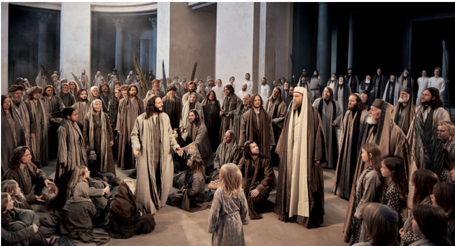
FIG. 6 This image shows Jesus opposite Caiaphas, the high priest, and with a diverse crowd of many constituencies around them. Critics point out that even with a crowd comprising multiple constituencies, the colours of these costumes are mostly limited to various shades of grey and brown. They differ in their materials – one can see that the high priests' clothes are made of much finer fabrics – but the contrast of colour and shape is not nearly as stark as it was in previous iterations, when the High Council wore enormous hats and much more colourful robes.

There are a few who have objected: they do not like Christian Stückl, they do not like the way he 'hoards power' among an inner circle of associates (in their view), and almost invariably they criticize his new choices. 58 One, for instance, told us that he thought the