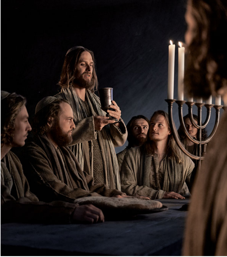
FIG. 1 This image shows the Last Supper, as depicted in the 2022 Passion Play. Note that Jesus and his followers all wear kippot , and are all costumed to match the Jewish crowds of Jerusalem. The Last Supper is lit by the seven-branched menorah – a historical anachronism (as this object was part of Temple ritual, not home ritual) but one that clearly demarcates the Passion Play’s ‘good guys’ as quintessential Jews. As Jesus holds up this glass of wine, he speaks not the liturgy associated with communion (‘This is my blood’), but rather the traditional Jewish blessing over wine.

debated and collaborated as they worked through the finer details of the script and dramatic action.