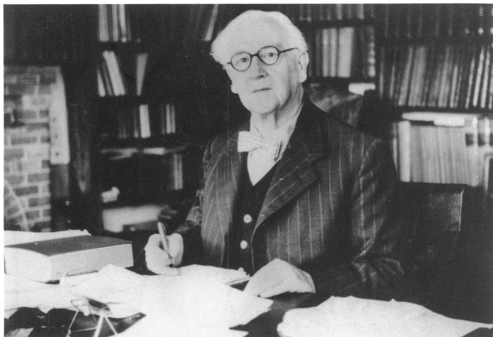
Plate 1. Photograph of Singer in his study at 'Kilmarth', Par, c. 1950s. (PP/CJS/c.30)