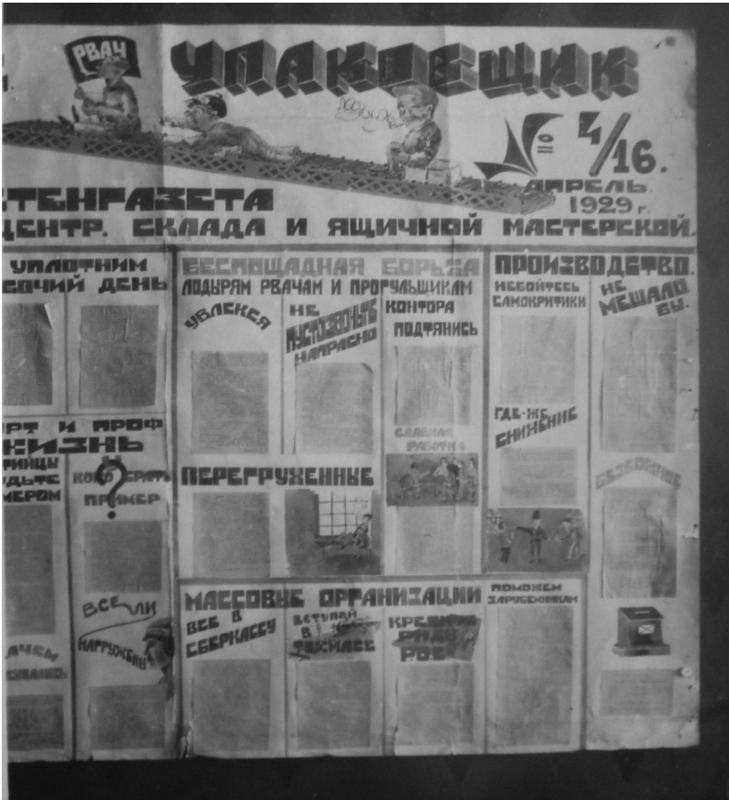
Figure 10 Soviet models for Paneuropa. Newspaper Upakovshchik [‘The Packer’].

congresses, typically held in one of the European capitals’ large hotels, bringing together politicians and industrialists. 63