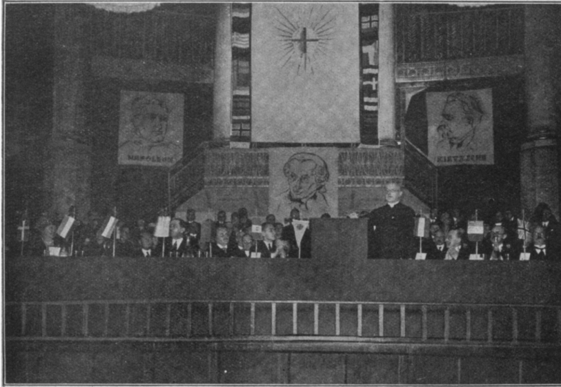
Der im Wiener Großen Konzerthausaal tagende erste Paneuropakongress. Allbundeskanzler Dr. Seipel hält die Eröffnungsansprache.