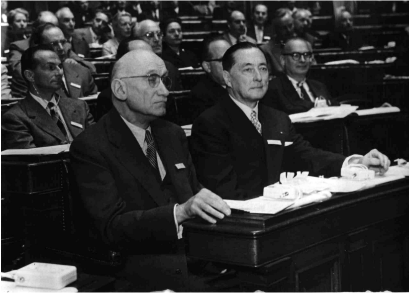
Figure 11 Coudenhove with Robert Schuman in 1956.

But Coudenhove's propaganda efforts eventually were absorbed in the Franco-British plans for European integration. One of the images of Coudenhove after the Second World War shows him seated next to Robert Schuman in the European parliament.