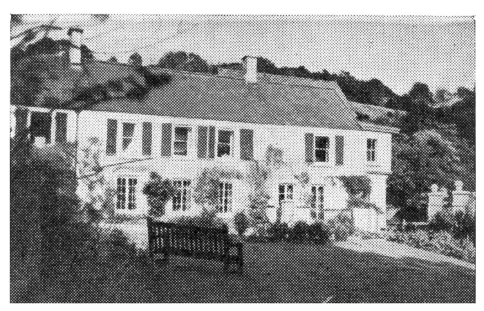
CRICKLEY COURT-ONE OF THE SEPARATE VILLAS

A REGISTERED HOSPITAL for the CARE and TREATMENT of LADIES and GENTLEMEN suffering from NERVOUS and MENTAL DISORDERS. Within two miles of the Western and London Midland Regional Railway Stations at Gloucester, the Hospital is easily accessible by rail from London and all parts of the United Kingdom. It is beautifully situated at the foot of the Cotswold Hills, and stands in its own grounds of over 300 acres. Voluntary Patients of both sexes are also received for treatment. Special accommodation is also provided at three villa residences, all of which stand in their own grounds and are entirely separate from the main Hospital. All the most modern methods of treatment including electric shock and prefrontal leucotomy are used.