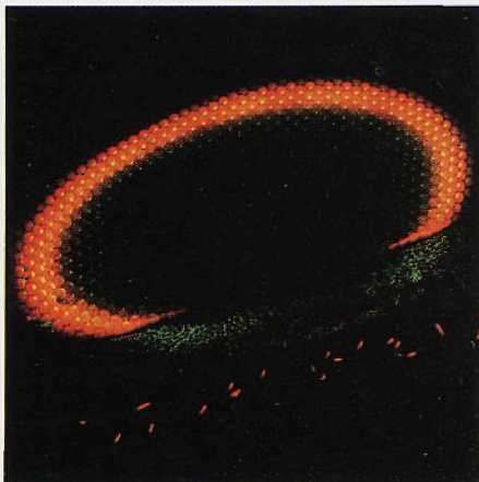
Fig.1: Confocal slice of a fly eye captured using a Zeiss LSM-510 attached to a Zeiss Axiophot and a 20X plan lens. Dual-laser excitation.

The best part of this procedure is that there is no staining of the sample involved. Simply focus onto the fly's eye. The fly's compound eye contains endogenous chromophores that fluoresce green, red and far red (see Lee et al. , 1996) upon excitation at various laser wavelengths (ranging from UV to visible light) so that it can be used to test systems equipped with a wide variety of lasers. The sample does not photobleach easily so that a single sample can be used to test numerous microscopes. The structural detail within the compound eye enables the resolution of the microscope to be pushed to respectable limits.