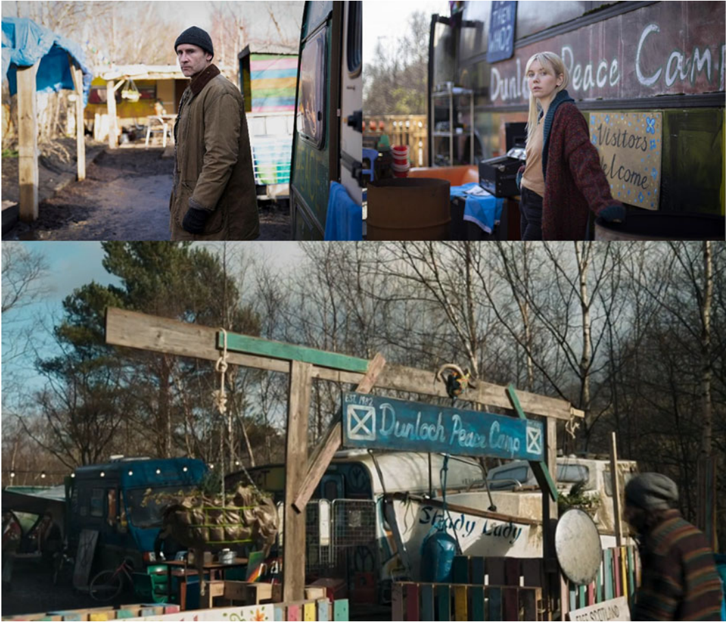
Figure 2. Dunloch peace cam.

aggression is caused by the possession of nuclear weapons) nor falsifiable (since we also cannot know that it is not). Rather, Chilton understands deterrence as a 'socio-cultural product' capable of performing powerful political work. 48 For instance, to 'deter' an enemy does not bestow that enemy with any rationality or agency: one cannot 'dissuade' a shark, but one may 'deter' it. Adversaries are thus not endowed any traits that would merit diplomacy or cooperation. Following, describing nuclear weapons as 'the deterrent' is often reserved for 'our' weaponry. In Western discourses, the United States 'deter' while Russia 'threatens'.