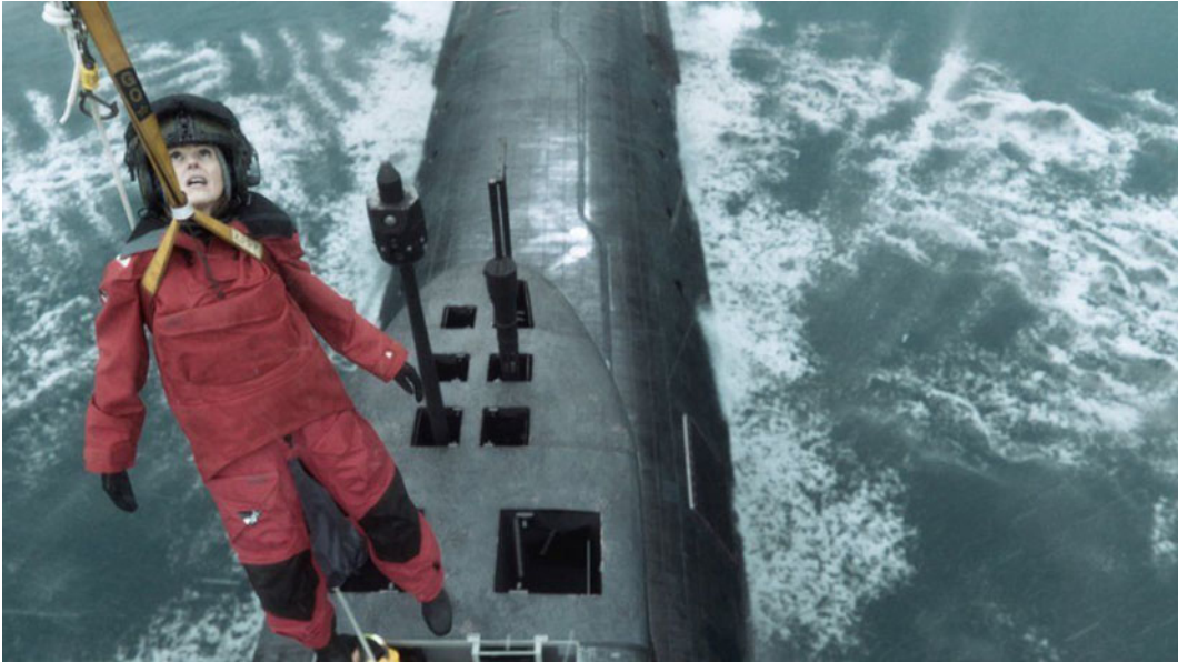
Figure 1. DCI Silva enters Vigil .

homogeneous category of ‘outsiders.’ 37 Vigil demonstrates the continuation of this narrative beyond high politics and into popular culture and the everyday. The exclusion of DCI Silva reinforces feminine incompatibility with rational decision-making and military spaces. The paternalistic treatment of DCI Silva reproduces the narrative of male military protection.