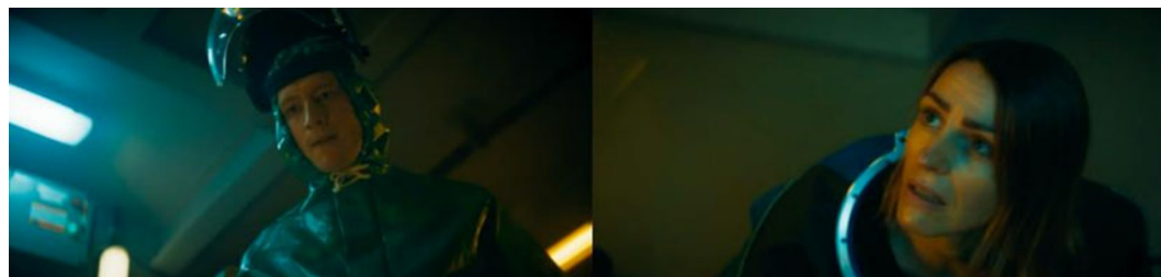
Figure 3. The spy is unmasked.

responsible stewards of international security, while other states are cast as fundamentally irresponsible and denied the same autonomy. 60 Decisions made by the United States and its allies are assumed rational by default, while decisions made by non-Western states are continuously labelled as ideological rather than strategic – delegitimised through reference to religion or culture. 61 Nuclear weapons possess the material capabilities no matter their state ownership, yet time and time again nuclear discourse constructs Western weapons as rational, modern, and safe while non-Western weapons are constructed as impulsive, backwards, and dangerous. Nuclear weapons can be understood as safe and secure in ‘our’ hands, while being dangerous threats in the hands of another. Continuing this narrative into spaces of the everyday, in the BBC’s Vigil , whether nuclear weapons are presented as agents of peace or destruction is conditional to their ownership – to whether they are controlled by ‘us’ or ‘Other’.