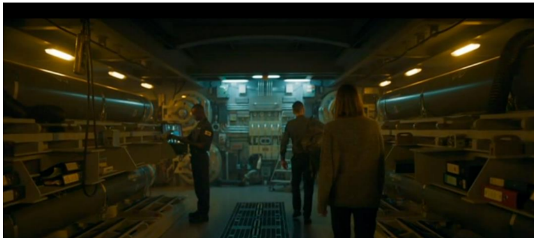
Figure 4. ‘Welcome to the bomb shop’.

a much bigger & more powerful one than [Kim Jong Un’s], and my Button works!’ 75 Carol Cohn frankly described the exchange as ‘penis-measuring’ 76 and Anoosh Chakelian situated the tweet amid a ‘long history of nuclear dick-waving.’ 77 This language does not highlight destructive power: men, women, and children are substituted with ‘collateral damage’, the weapons are imagined as newborns ‘fathered’ by man, and phallic imagery and sexual metaphors make nuclear weapons referents of masculinity. 78 Such gendered sexual metaphors create excitement and support for nuclear weapons. 79