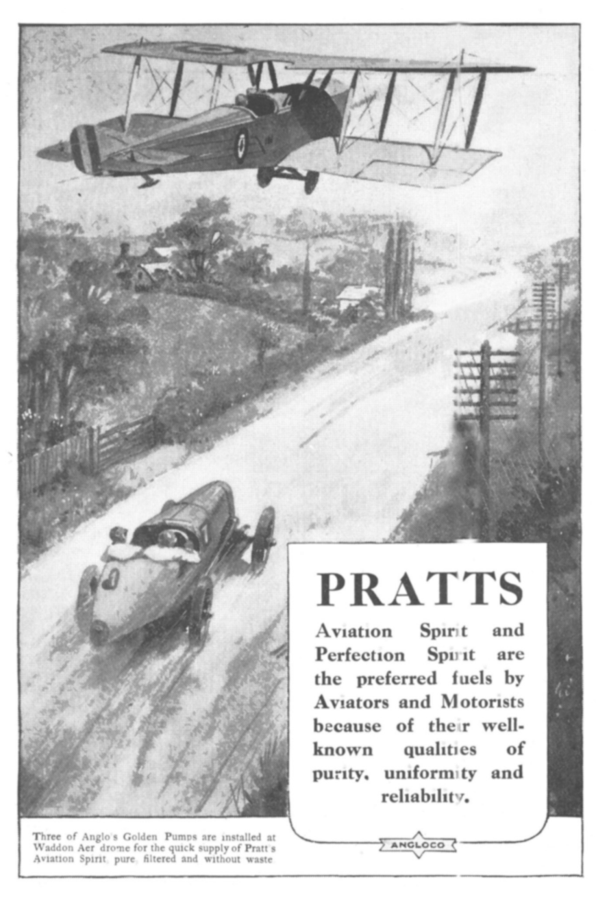
ANGLO-AMERICAN OIL CO, LTD 36, Queen Anne's Gate, London, SW 1