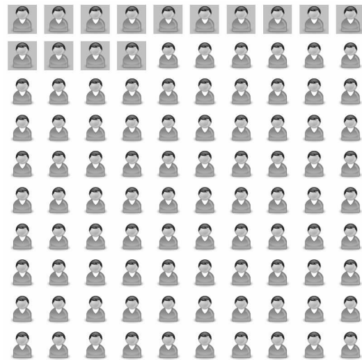
Figure 2: Pictograph used in Study 2

timate the depicted probability level. After this, the experimenter conducted an interview about the processing of the graph, particularly dealing with the question about whether the participant had counted the icons or not. The interviews were then transcribed and coded as either 1, meaning the icons were counted, or 0, meaning the icons were not counted (variable “counting”). Furthermore, we analyzed the transcripts in regard to whether the participants had spontaneously mentioned (i.e., without us asking for this information) the numbers depicted in the graph in the form of percentages or frequencies (coded as 1 “yes” or 0 “no”; variable “mentioning numbers”).