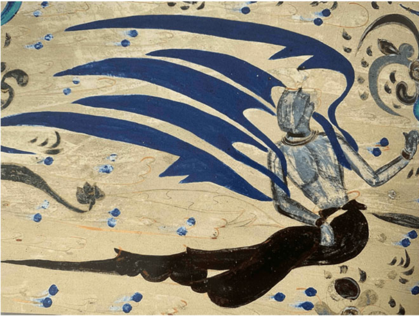
Figure 10. Flying apsara, 535–57. Mural. Dunhuang: Mogao Cave 285.