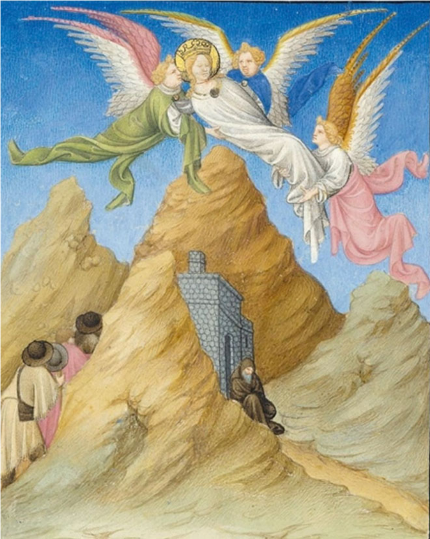
Figure 9. Angels transporting St Catherine's body, The Belles Heures of Jean de France, duc de Berry, 1405–1408/1409. Tempera, gold, and ink on vellum, 23.8 × 17 cm. New York: The Metropolitan Museum of Art, 54.1.1a, b, fo. 20r.

The cross, a central symbol of Christianity, appears three times on the Vilioni slab, integrated in the imagery as well as the text. The Christ Child's halo is inscribed with it, and it frames the inscription both at the beginning and at the end. Besides the previously mentioned Xi'an stele and Luoyang pillar, the cross is the most common feature of thirteenth- and fourteenth-century eastern Christian tombstones from Quanzhou and elsewhere. The