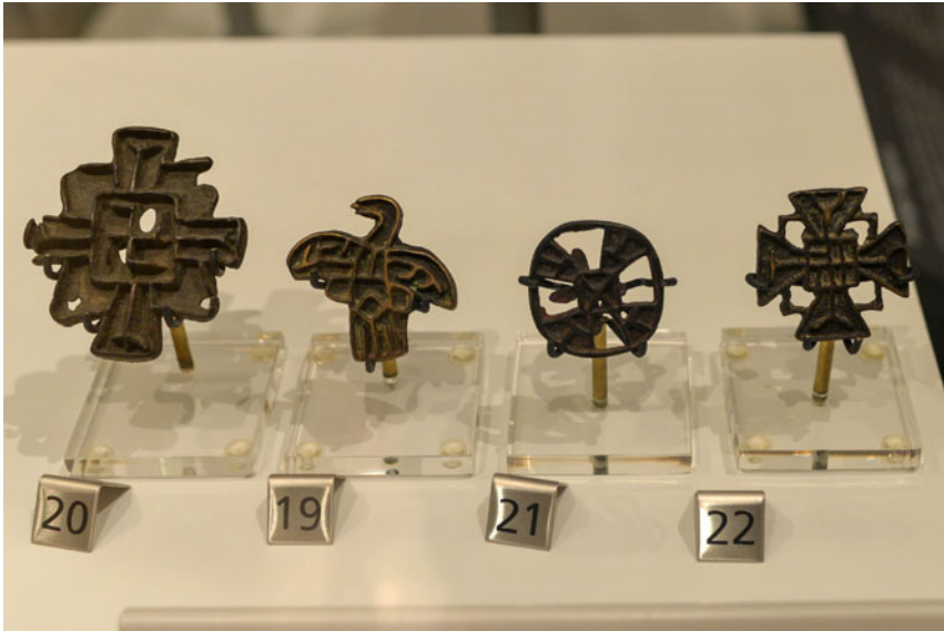
Figure 13. Ordos Crosses, tenth–fourteenth centuries. Cast bronze. Toronto: Royal Ontario Museum, Bishop William C. White Collection.

behind this object's creation. Instead of arguing through a binary system of influence and reception, acknowledging the porous nature of cross-cultural artefacts is key. By drawing on 'cultural ambiguity' as a more useful category of analysis, my approach shifts the emphasis from the geographic points of origins to an appreciation of the mobility of these multicultural features as well as the process of their displacement. 126