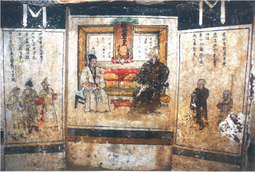
Figure 6. Tomb mural with deceased couple flanked by their three sons and a Buddhist monk and his attendant, 1309. Mural. Tomb at Hongyucun, Xing county, Shanxi province.

the unclothed back of Dou E recalls Buddhist judgment scenes, where the punishment is carried out on similar semi-nude bodies. 108 The silk painting by Lu Zhongyuan (active c. 1271–1368) envisions the torture of men and women, clad in loincloths, on the orders of one of the Ten Kings of Hell. 109 The disrobed figure of St Catherine awaiting execution on the Yangzhou slab thus probably reflected this firm association between the disrobed body and punitive mutilation in Yuan visual culture.