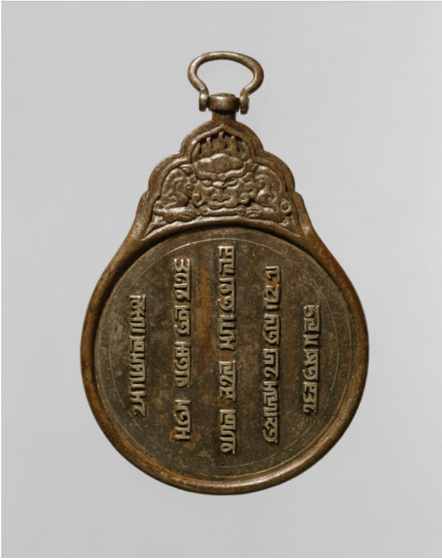
Figure 14. Paiza (Mongol safe conduct pass), late thirteenth century. Iron with silver inlay, 18.1 × 11.4 cm. New York: The Metropolitan Museum of Art, 1993.256.

diplomat and monk Rabban Bar Şawma also received a similar paiza when Arghun Khan dispatched him as the leader of an Il-khanid embassy to western Europe in 1286. 132