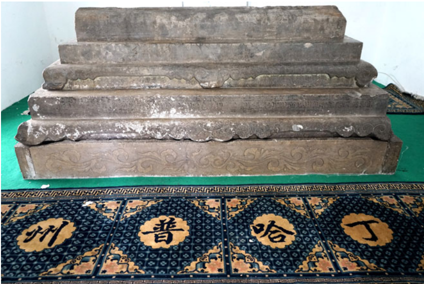
Figure 8. Tomb of Buhading, 1275. Granite. Yangzhou: Transcendent Crane Mosque.