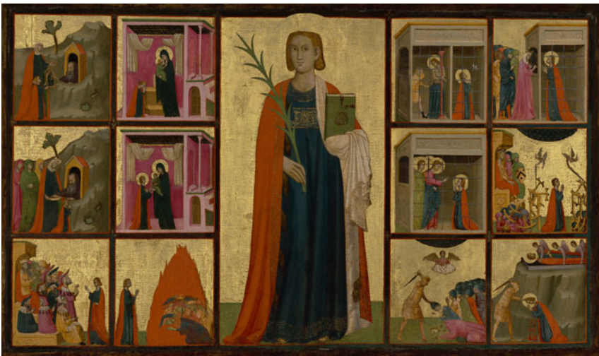
Figure 5. Donato and Gregorio d'Arezzo, St Catherine and scenes from her life, c. 1330. Tempera and gold leaf on panel, 107 × 174 cm. Los Angeles: The J. Paul Getty Museum, 73.PB.69.