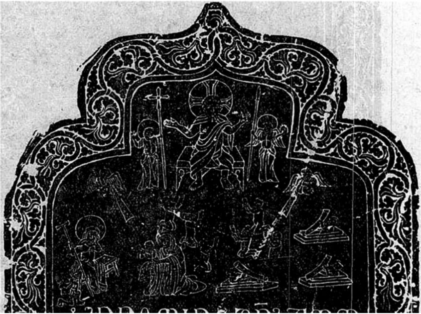
Figure 4. Antonio Vilioni's tombstone (detail), 1344. Facsimile of the rubbing of the granite tombstone. Yangzhou: Marco Polo Museum.