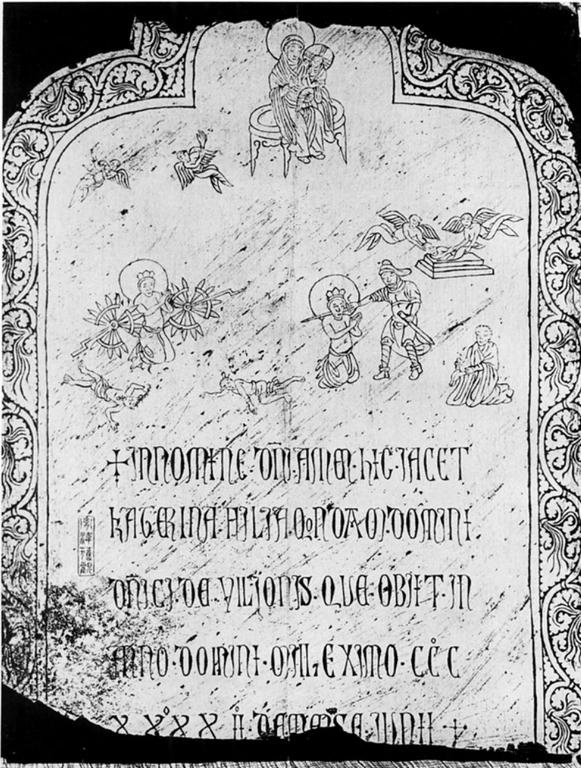
Figure 2. Copy of Caterina Vilioni's tombstone. Negative reproduction of the facsimile of the original rubbing made in 1951.

in excellent condition, and only the top and the bottom of the grey stone slab have been damaged. The upper half of the funerary monument is decorated with low-carved reliefs depicting the enthroned Virgin Mary and Child