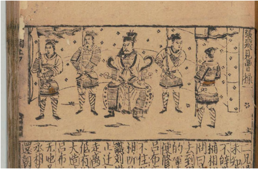
Figure 7. Soldiers dressed in Mongol fashion, The Plain Tale of the Three Kingdoms ( Sanguozhi pinghua ) composed in the Song and Yuan, printed in 1321–3. (Tokyo: National Diet Library.)