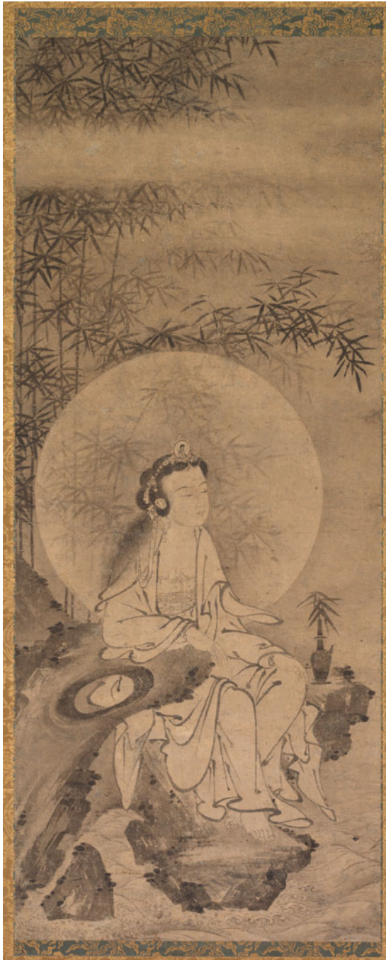
Figure 12. Zhang Yuehu, Guanyin, late 1200s. Hanging scroll, ink on paper, 104 × 42.3 cm. Cleveland: The Cleveland Museum of Art, 1972.160.