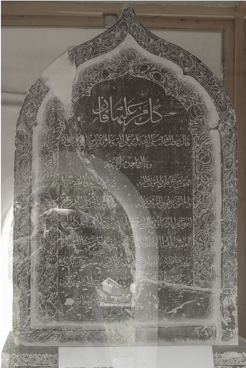
Figure 3. Tombstone of ‘Aysa Khātūn, 724 AH/1324. Granite. Yangzhou: Transcendent Crane Mosque.