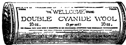
One sixth actual size

Realises an ideal hitherto unattained. It is in fact as well as in name a three (3) per cent. double cyanide wool. The antiseptic is distributed uniformly and not in patches. Ordinary double cyanide wool looks patchy and when tested will be found to be patchy. On the contrary, in 'Wellcome' Brand Double Cyanide Wool the distribution of cyanide looks uniform and is proved to be uniform on quantitative test. This wool is remarkable also for its softness. The cylindrical packing is convenient for the removal of small quantities as required for use.