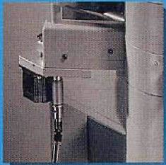
motor driven stage