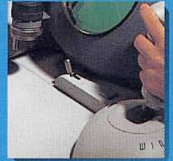
motorized screen lift